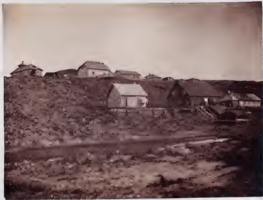
Nushagak looking South